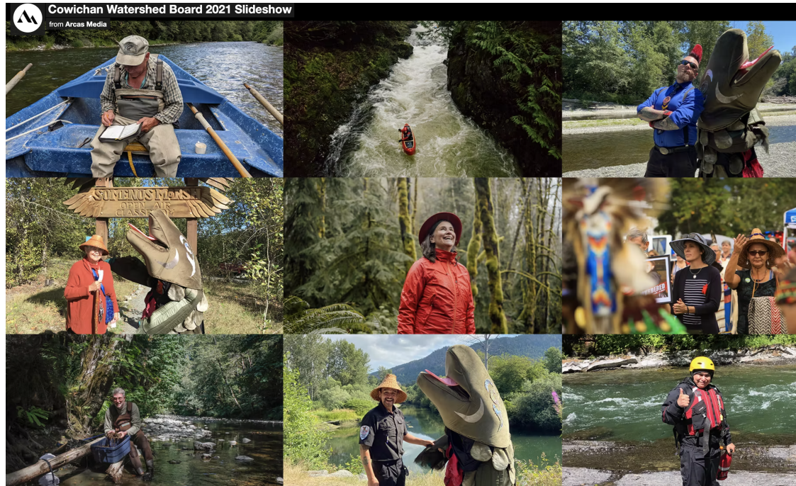
Cowichan Watershed Board 2021 Slideshow

Video should be available in this newsletter if not a link is below, then make sure to hit the play button.